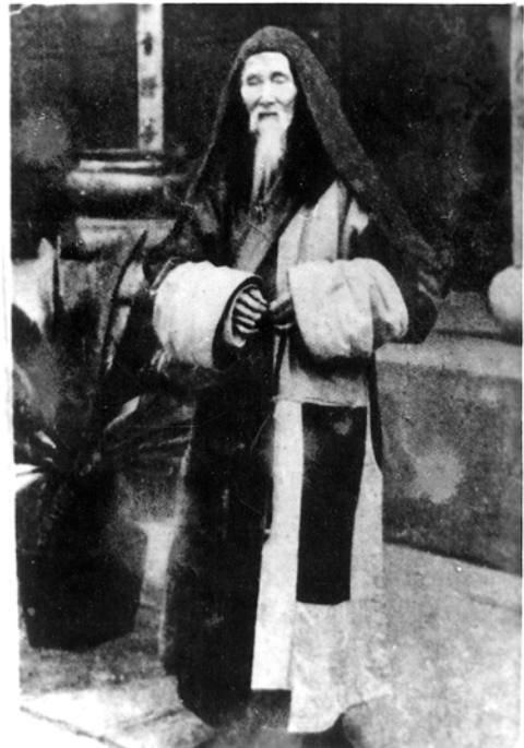
Master Xu (Hsu) Yun

When it comes to love, be a big spender!